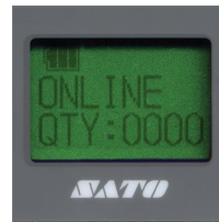
Large LCD Display (802.11 b/g model)