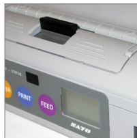
Top Cover Opening for Easy Media Load