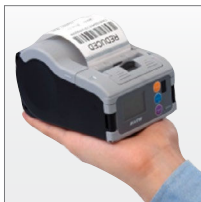
Small & Light Durable & Dependable

Quick and Durable. Ultimate Performance and Mobility.