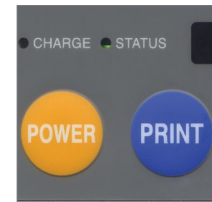
Large Operator Control Buttons