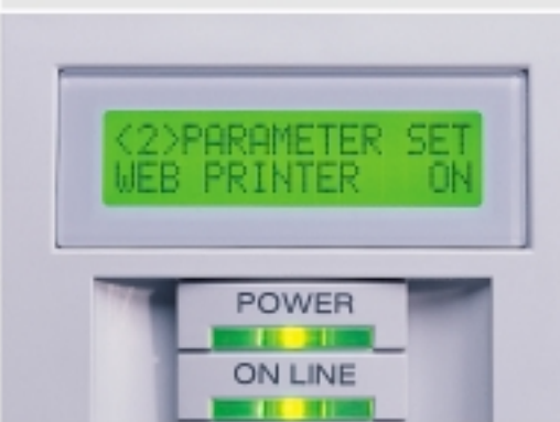
▲ User-friendly display