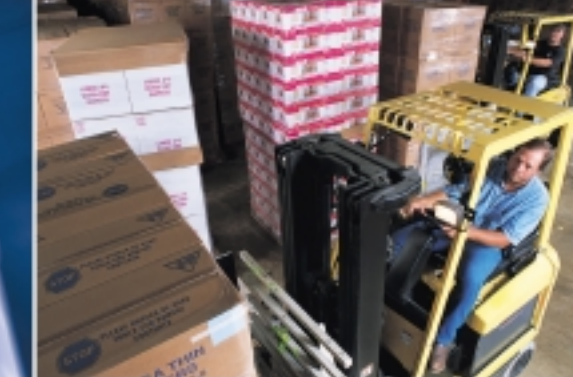
▲ Time-saving and minimal training due to fast and easy handling